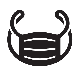
Face Masks Required